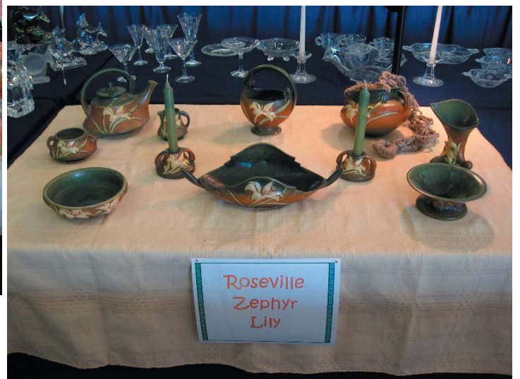
PROG Member Displays