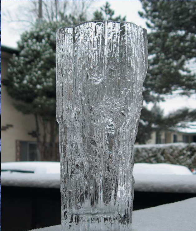
Ittala vase from Finland